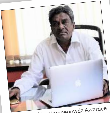
Nada Prabhu Kempegowda Awardee