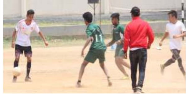
Joy of Emotions